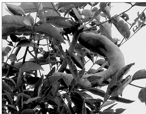
Fig. II – Horn-like gall produced by Baizongia pistaciae on Pistacia terebinthus.