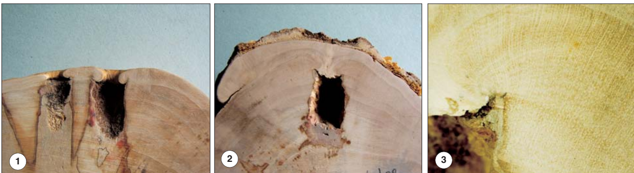
Fig. III – Cross-sections of A. negundo trunks with A. chinensis exit holes partially (1) and fully closed (2) by the plant reaction, and a cross-section prepared for annual ring analysis (3).