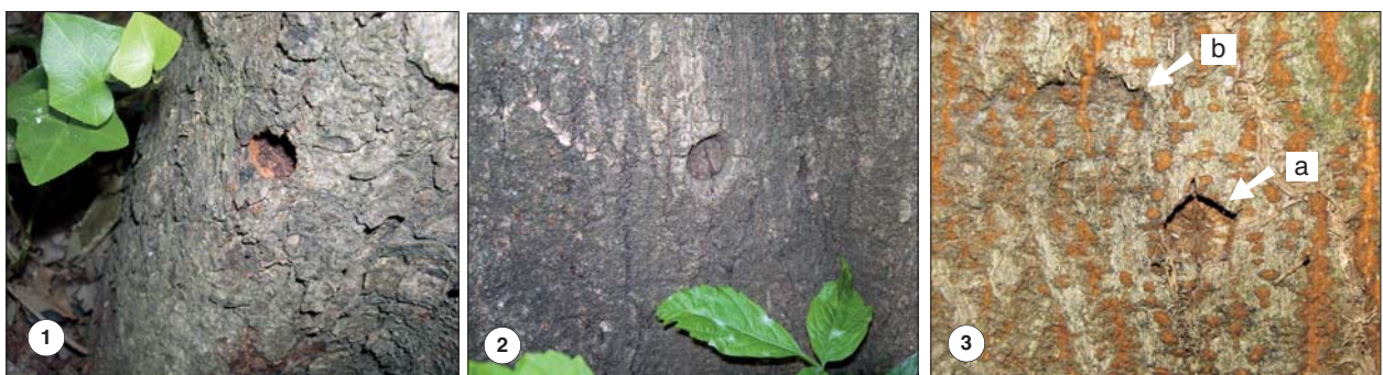
Fig. II – A. chinensis exit holes: current year (1); exit holes fully closed by the plant reaction (2); comparison of two exit holes fully closed by the plant reaction (3), with clear margins of the hole (a) and with margins no longer observable due to the tangential expansion of the bark during tree growth (b).

In the infested site the felled trees were attacked exclusively by A. chinensis , since only this species emerged from the wooden material stored in the insect cages. Stumps of trees were cut at a height of 20-50 cm from the ground level with a chainsaw. The root collar was cut close to the ground line so as to collect as much of the wood as possible, whereas, the tree root system was not sampled. Collection of the wood samples required much care to preserve the entire section of the stump or at least most