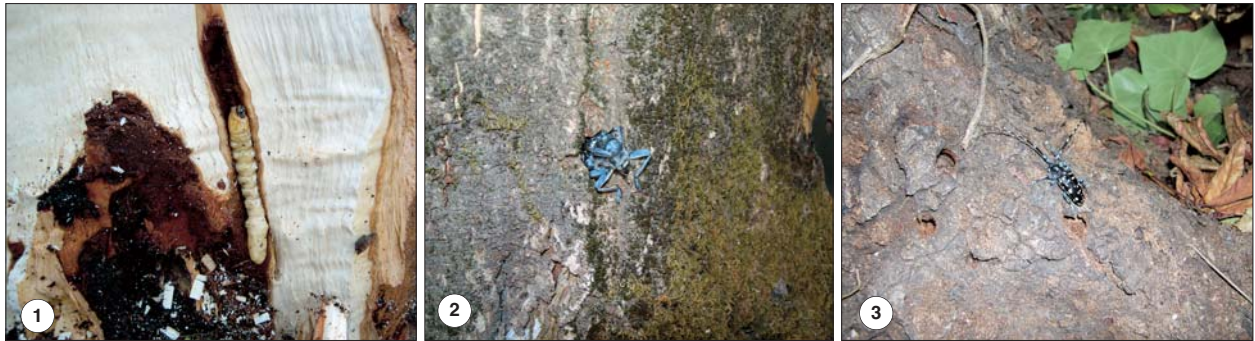
Fig. I – A. chinensis : a well grown larva in a gallery in the xylem of an infested tree (1); adult specimen (female) during the emergence from an infested tree (2); adult specimen (male) just emerged and walking on the stump of a tree (3).

but the exit hole is eventually enclosed by the reaction tissue (callus) and after some years the hole is no longer visible (Figs. II, 2 and 3). However, such injuries can be recognised after many years by inspection of the wood after cross-sectioning of the tree. It is possible to date the time of occurrence of the injury using the annual growth ring method for tree age analyses, i.e. by counting backwards from the year of felling to the margins of the exit hole (if the tree is still alive at the time of felling). Dating damage caused by woodboring insects is a feasible approach in studies of an insect outbreak history (SCHWEINGRUBER, l.c. ). Previous studies on dating exit holes of Anoplophora glabripennis (Matschulsky), a species close to A. chinensis in many aspects, suggested the possibility to analyse the dynamics of an infestation through the years and the pattern of infestation in a given area (SAWYER et al. , 2004; SAWYER, 2007). The aim of the present study was to date A. chinensis exit holes at the infested site in Rome in order to obtain information on the dynamics of the infestation.