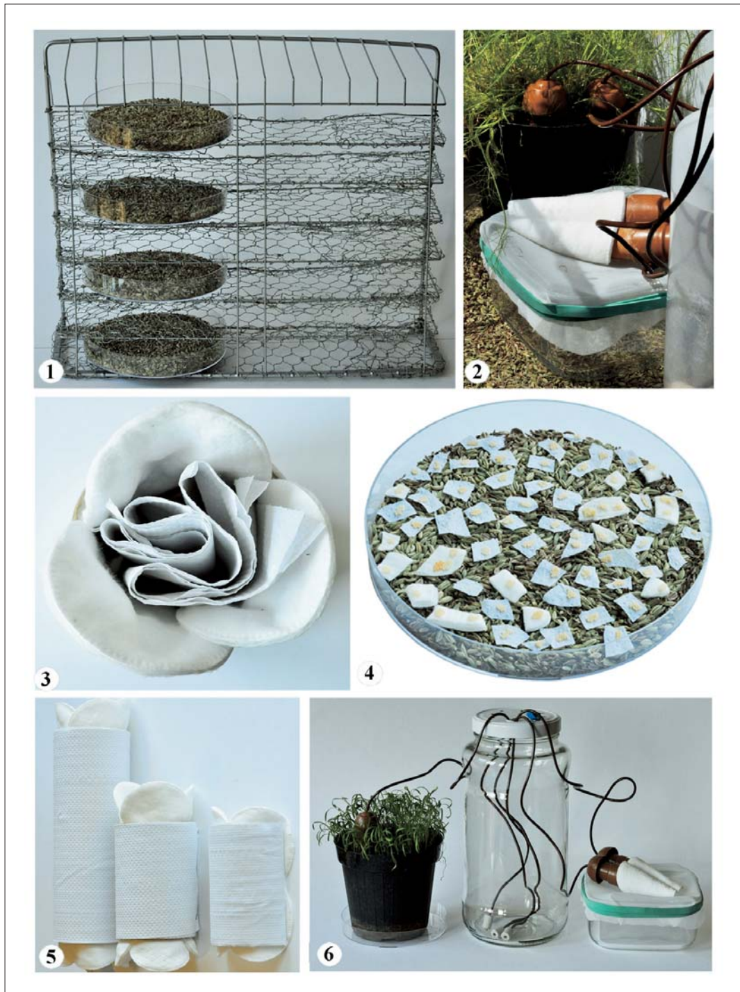
Fig. II – 1. Metal rack with petri dishes filled with Apiaceae seeds. 2. Seepage control sprinklers with porcelain head parts enveloped in wet cotton disks. 3. Edge of a cardboard tube with protruding cotton disks and soft absorbent paper. 4. Graphosoma lineatum (L.) egg batches placed on Petri dishes filled with Apiaceae seeds. 5. Cardboard tubes of different sizes. 6. Seepage control sprinklers set up for providing insects and plants with water.