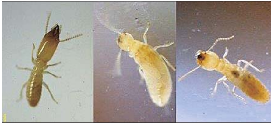
Fig. II – Sample of R. lucifugus collected in the gym. From left: soldier, nymph and worker.