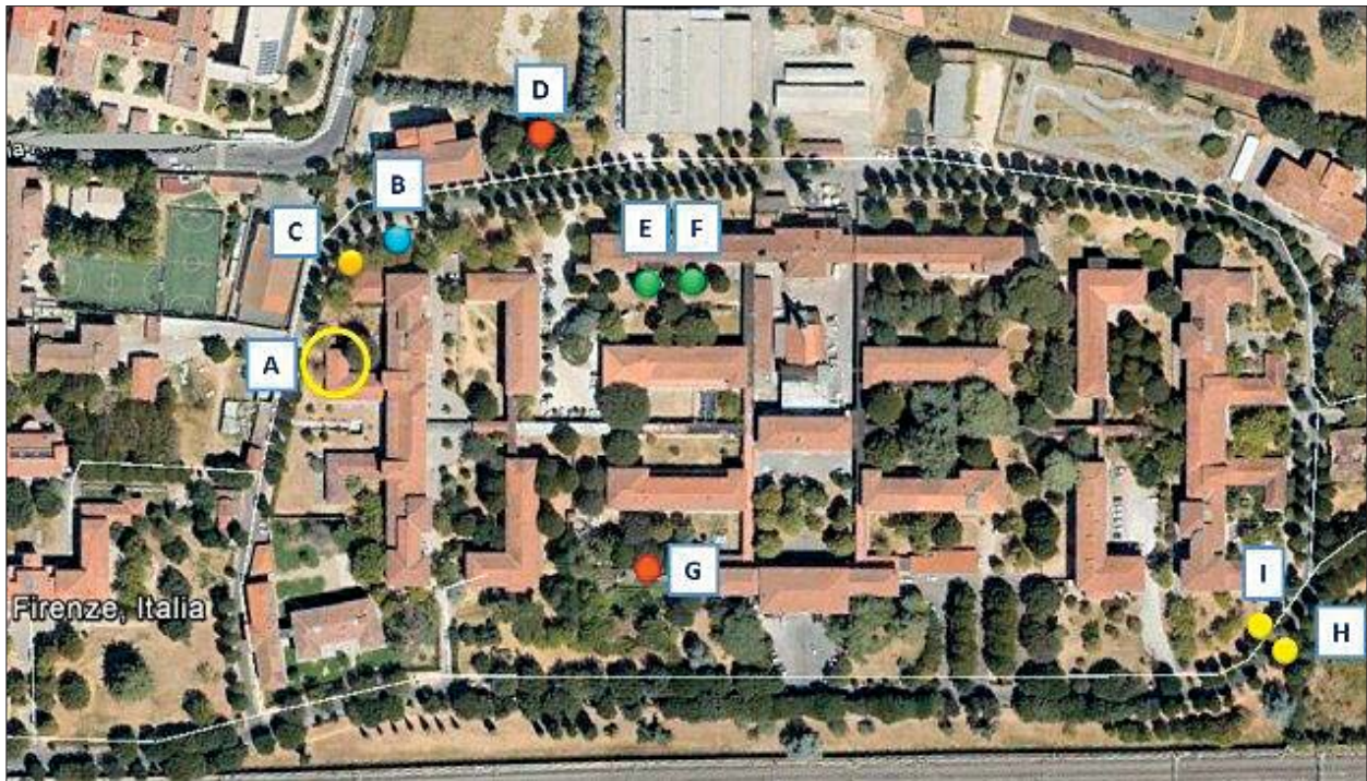
Fig. IV – Aerial view of the study area, showing the areas where active termite infestation was recorded during the monitoring program. Yellow circle= gym floor infested by R. lucifugus and K. flavicollis ; Blue dot= tree stump infested by R. lucifugus ; Yellow dot= tree stumps infested by K. flavicollis ; Orange dot= necrosated roots of maple tree infested by K. flavicollis ; Green dots= necrosated roots of linden trees infested by K. flavicollis ; Red dot= collapsed trees.

plant appeared visibly carious and a conspicuous infestation by both wood boring beetles (Dynastidae) and K. flavicollis was detected. Although it is not possible to link the causes of the tree's collapse to termites, their potential role should not be neglected.