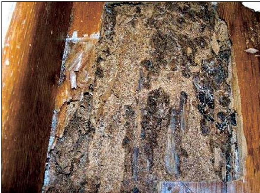
Fig. I – Strips of the parquet of the gym monitored in the study area, showing the typical signs of attack by subterranean termite. The wood appears lined with termite droppings, that being rich in moisture tend to clot and stick to the point where they are released. The droppings, mixed with soil and saliva, are used to construct the cells and galleries occupying the space freed by the wood consumption, forming the so-called “replacement wood”.

Given their cryptic and elusive nature, termites establish their colonies without being detected, so that when their presence is discovered, the damages are already heavy and