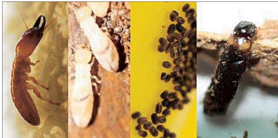
Fig. III – Sample of K. flavicollis collected in the gym. From left: soldier, nymph, typical prismatic faeces and royal.