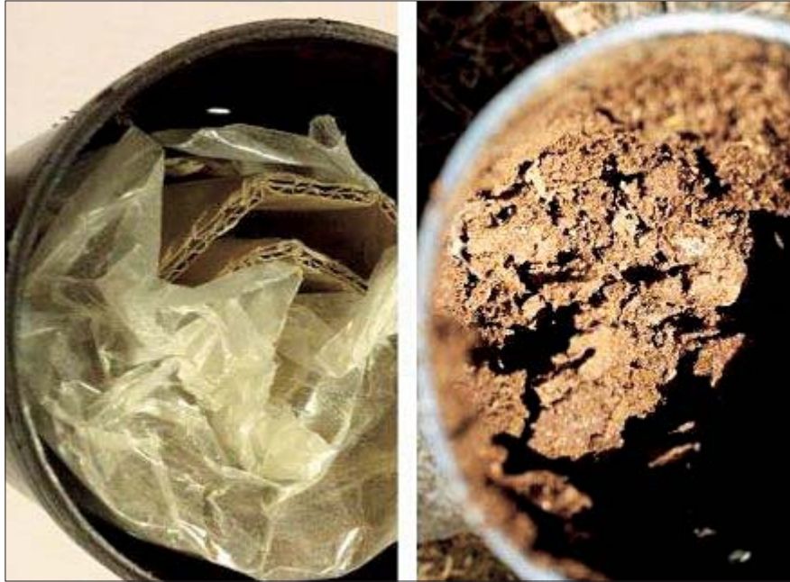
Fig. V – Appearance of a bait station before (left) and after (right) the termite attack. The feeding activity is clearly visible from the total transformation of the bait.