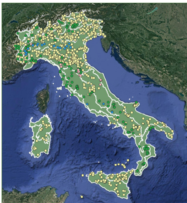
Figure 3 - Visualization of the National Basic Materials Register (by coordinates of the forest reproductive material in the register) on the RP map, with colours of basic materials according to the type of material (yellow = source-identified, green = controlled, pink = qualified, blue = tested).

The success of a plantation mainly depends on the adaptation of FRMs to the environmental conditions at the planting site. Today, due to the long-life cycles of forest trees, the selection of new basic materials should be conducted taking into account climate projections for the next 30-100 years, i.e. when the trees planted now will be mature. Genomic-assisted selection of functional adaptive characters could give a valid contribution (Konnert et al. 2015), and identifying, in the range of a species, sub-regions of provenance with climatic characteristics similar to those of future projections would be crucial. However, scenarios are mere projections, and we are unable to forecast the evolution of climate in the next 200 years. On the other side, more genetic diversity selected within a RP can provide raw material for adaptation to assure resilience of forest ecosystems to climate change: high levels of genetic diversity increase the probability of genotype survival and adaptability of the population. At the rear edge of the geographical range of forest species local conditions might change drastically in the future due to climate changes. In these conditions, high levels of genetic diversity should be achieved, as well as FRM from these marginal populations might be better adapted to extreme climate conditions (drought, high temperatures) and become a valuable