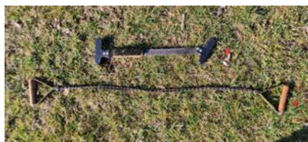
Figure 3 - Manual tools used for girdling: Cutting girdler (A) and Chainsaw girdler (B).

To evaluate the presence and the vigour of the girdling effects, the competitors were classified in four different classes (1-4) with increasing relevance (Tab. 1).