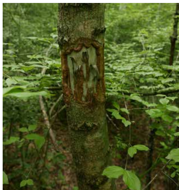
Figure 4 - Scar cords on girdled direct competitors.

The variations of light under the canopy of selected trees were estimated in Summer measuring the photosynthetic active radiation (PAR) under 15 trees (5 trees per each treatment) and in open space close to the study area, by using a ceptometer AccuPAR LP-80 (Decagon Devices, Pullman, WA, USA) at midday on sunny days. Transmittance was calculated as percent fraction of below-canopy light, divided by the incident radiation (Chianucci and Cutini 2013, Cutini et al. 2015). The meas-