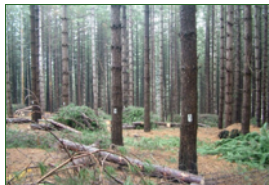
Figure 1 - Study area: site A (left) and site C (right).